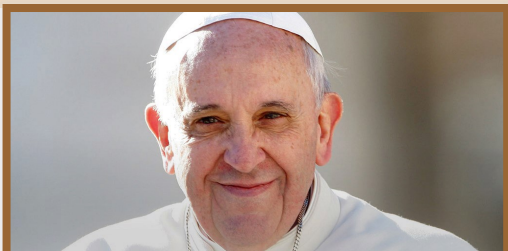
Pope Francis recognises the special connection between grandparents and their grandchildren

The theme to this year's Catholic Schools' Week is 'Communities of Faith & Resilience'. As Grandparents you have a special connection with your grandchild. You are a role model in faith for them. You help them to make good choices and decisions and show them how to be part of a community. Encourage your grandchild to follow the example of Jesus, by showing them how to be kind and treating others as they would like to be treated. You can teach them how to be resilient by helping them to get back up and keep going, when they find things tough. They learn so much from you.